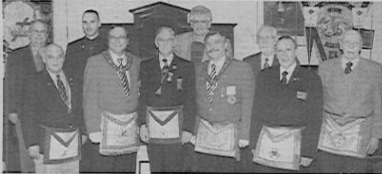
Companions in attendance for Grand High Priest's visit.