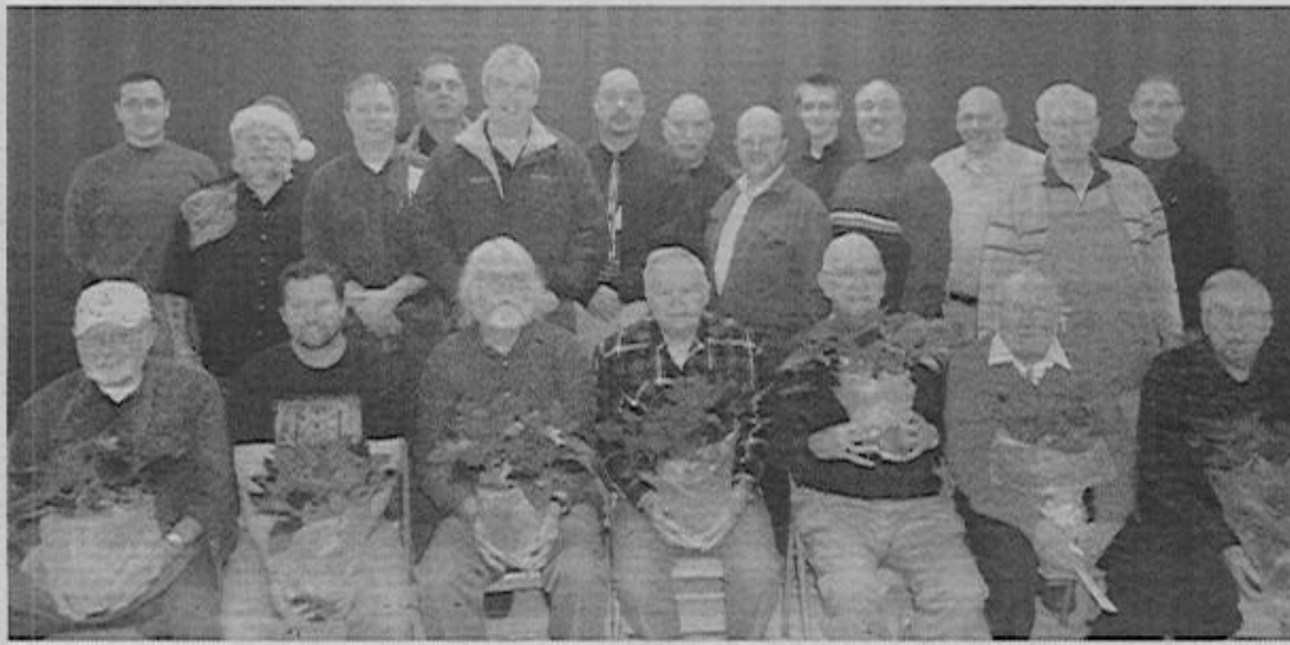
Brothers of Webster Lodge gathered for the annual breakfast and then delivered Poinsettias and visited with Brothers who are unable to attend Communications.

The growth of a Masonic Lodge can't get any better than that, my friends.