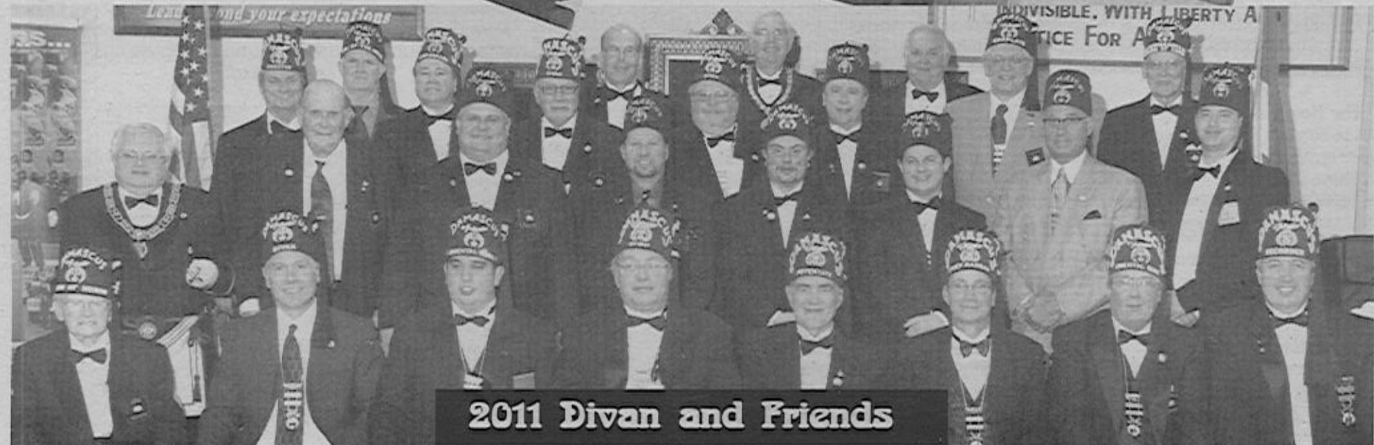
2011 Divan and Friends